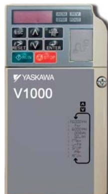
Yaskawa V1000 Motor Controller Drives