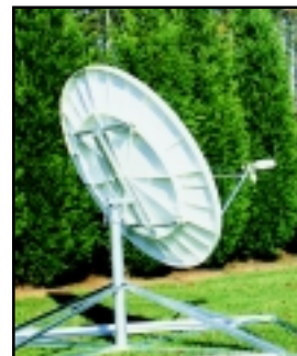
Back View Series 1183

Prodelin Corporation is the world's largest manufacturer of Rx/Tx VSAT antennas. We have the broadest product line in the industry including Receive Only, Rx/Tx and Rural Telephony antenna systems. Prodelin offers nineteen antenna sizes, 47cm to 4.5M. Prodelin is the leader in obtaining type certifications and approvals for Intelsat, AsiaSat and Eutelsat. Prodelin antennas provide the best quality in the market due to the sophisticated, precision SMC compression molding process technology. Prodelin provides the best value antenna solution to the market with competitive prices, the highest quality products and superb engineering support. Prodelin is ISO registered, KEMA # 70022.01. Prodelin - The Market Leader in VSAT Antennas.