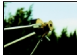
Option Ku-Band Feed