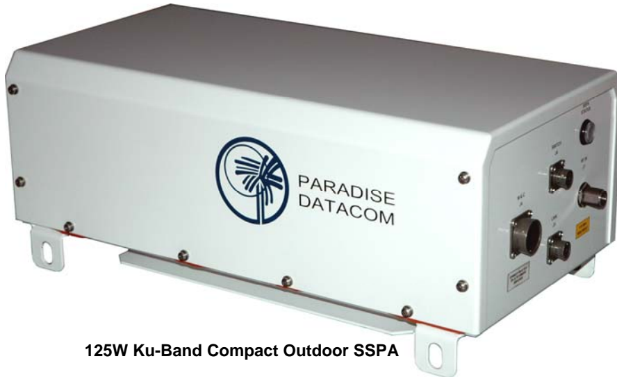
125W Ku-Band Compact Outdoor SSPA