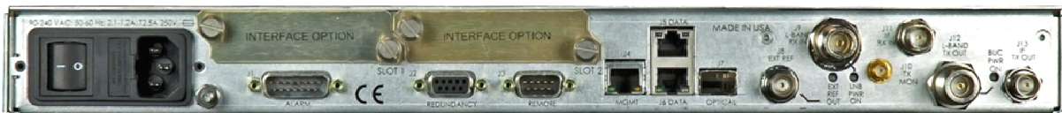
CDM-750 Rear Panel