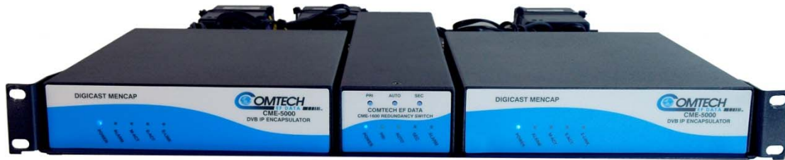
CME-5110 MENCAP Redundancy Bundle